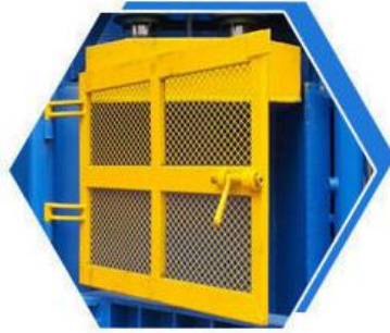
3 Safety door