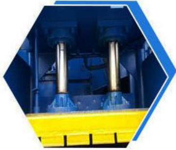
1 Hydraulic plate