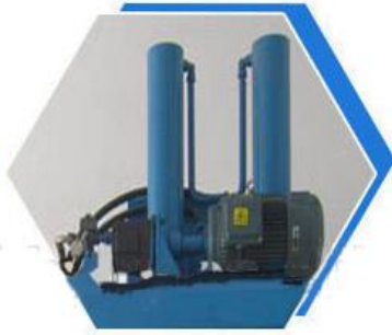
5 Hydraulic cylinder