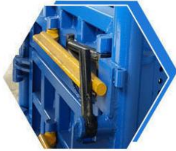
2 Door lock