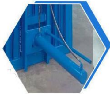
6 Push out device